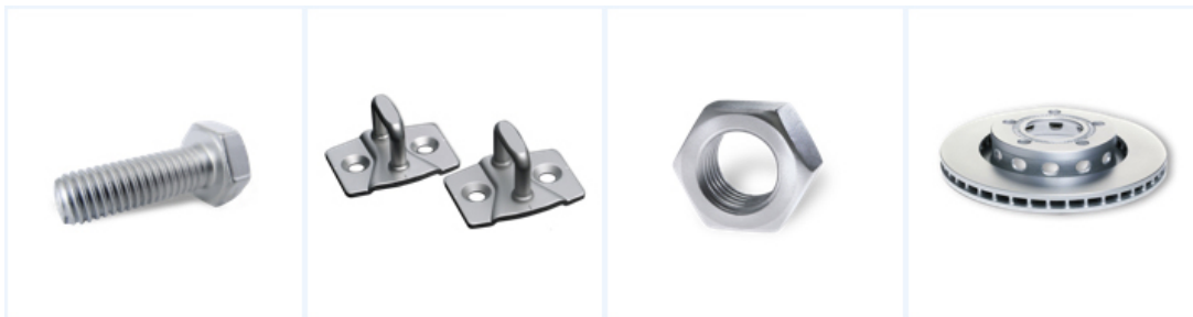
Non metrical threaded parts