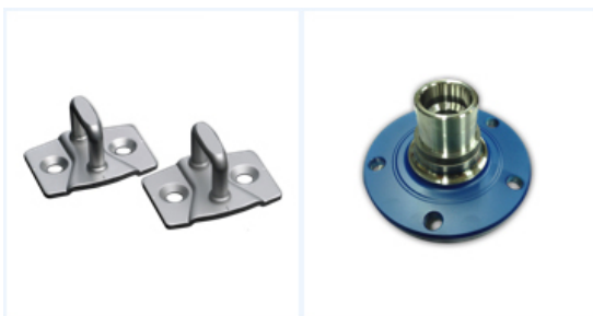
Stamped parts Bearings