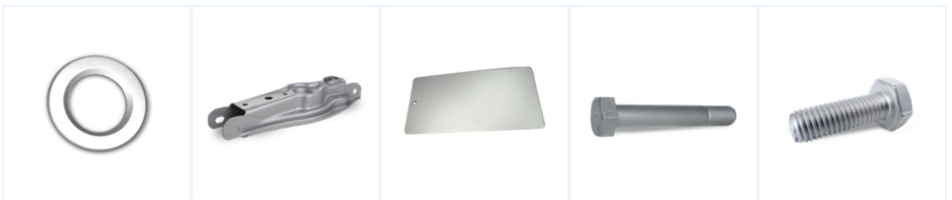
Washers Big parts Panels Metrical threaded bolts >M16 Non metrical threaded parts