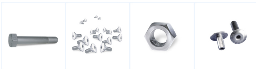
Metrical threaded bolts >M16