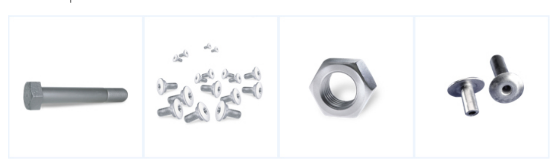
Metrical threaded bolts > M16