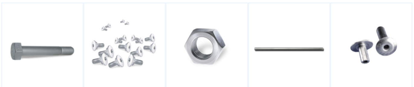
Metrical threaded bolts >M16