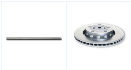
Pipes and tubes