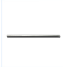
Pipes and tubes