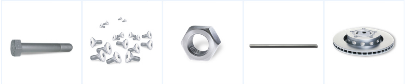
Metrical threaded bolts >M16