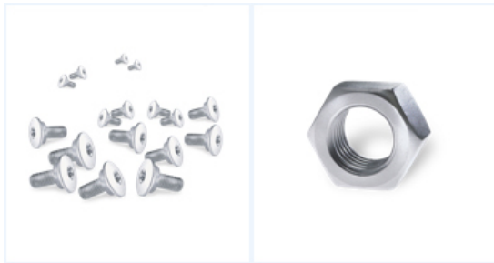
Metrical threaded bolts M2-M16 Nuts