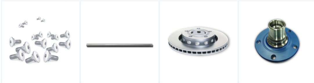
Metrical threaded bolts M2-M16