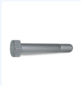
Metrical threaded bolts >M16