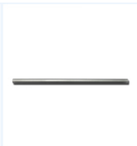
Pipes and tubes