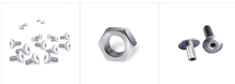
Metrical threaded bolts M2-M16