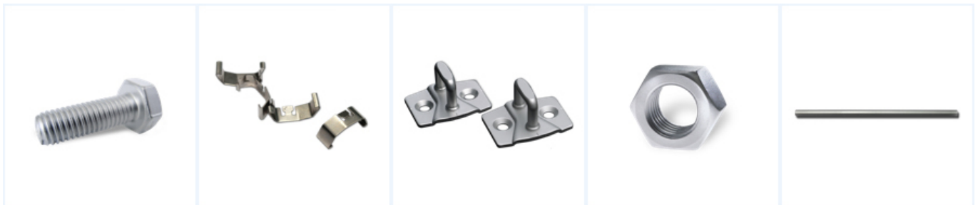
Non metrical threaded parts