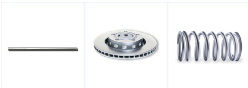
Pipes and tubes