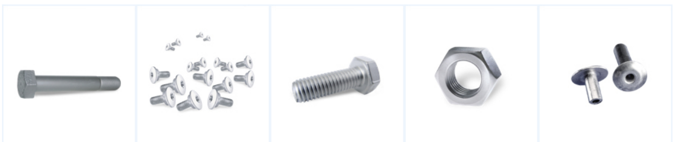
Metrical threaded bolts >M16